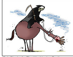
Enlarge Photo