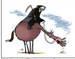
(Bob Staake for The Washington Post)

Next Week: If Only! or History Repeals Itself